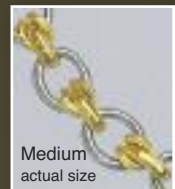
Medium actual size