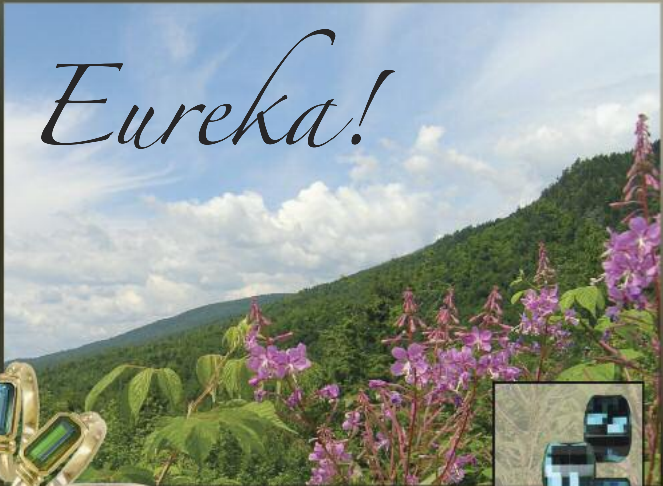
View of Plumbago Mountain