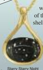
Starry Starry Night

The treasures we are all searching for are the same. Your choice of stones, 14K gold, 18" chain.....$ 750.00