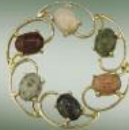
Winter Sea Circle Pin #X1888.....$685.00