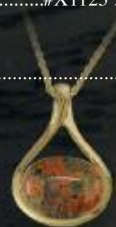
Cadillac Mountain Peach