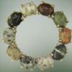
Autumn Harvest Circle Pin #X1887.....$750.00