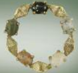
Spring Leaf Circle Pin #X1889.....$725.00

Gold prices are currently changing. Please see our website for current pricing.