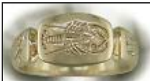
Mystic ciphers side views

Gold prices are currently changing. Please see our website for current pricing.