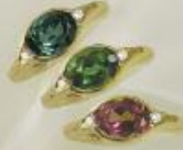
Tide's Edge Rings