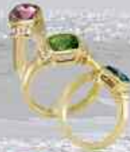
low profile side view