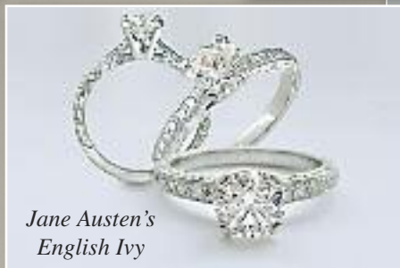
Jane Austen's English Ivy