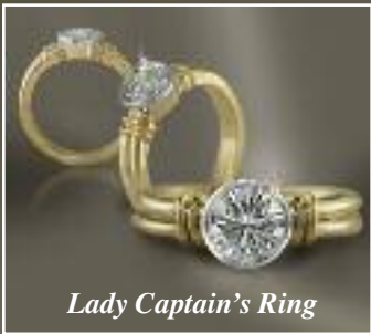
Lady Captain's Ring