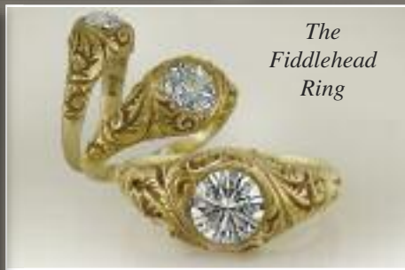
The Fiddlehead Ring

To learn more about these Cross styles and to see additional designs, visit us on-line at www.CrossJewelers.com